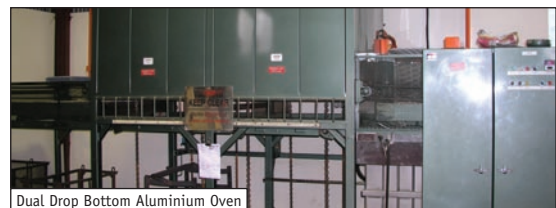
Dual Drop Bottom Aluminium Oven

HTL use a Dual Drop Bottom Oven specifically designed for the solution treatment of aluminium or copper alloys. Features include: computer control and data logging, hot or cold water quench, <5 second quench delay, approved to AMS-2750D class 2 for aircraft aluminium heat-treatment.