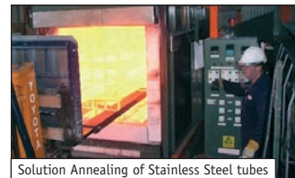
Solution Annealing of Stainless Steel tubes

We have a full range of general heat treating available; annealing, stress relieving, tempering, solution, precipitation, etc. Pictured to the right is our largest Bogie Hearth Furnace which has internal dimensions of 1100 x 1100 x 3000mm.