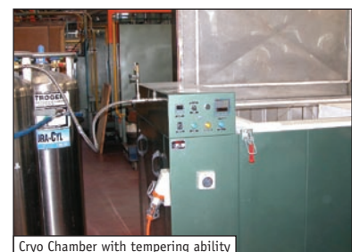
Cryo Chamber with tempering ability

Cryogenic tempering is a heat treatment in which the material is cooled to cryogenic temperatures as low as -185^{\circ}\text{C} , usually using liquid nitrogen. It has been shown to increase strength and hardness in some circumstances, sometimes at the cost of toughness. Whilst the cryogenic process is a relatively new discovery, there is evidence that most tool steels will demonstrate an increase in wear resistance after cryogenic processing. This treatment is more suitable for tool steels, high-carbon and/or high-chromium steels where the absolute maximum possible wear resistance is the primary requirement.